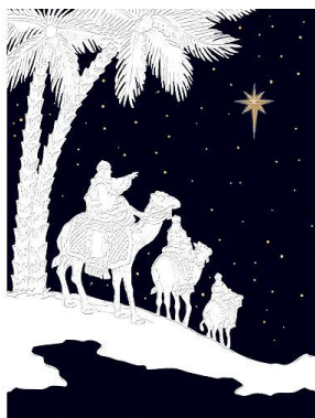
THE WISE STILL SEEK HIM

Christ the newborn king Humble born as angels sing-- Rafter doves take wing Infant son asleep Savior eyed by woolen sheep-- Tucked in manger deep Mother keeps in sight A star in the east shines bright-- Silent holy night