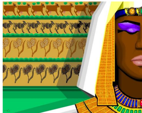
"Dream" by Deborah Reeder

Do you recall who is pictured here dreaming? Can you interpret the dream as shown on the wall? What man of God was called in to interpret the dream? See Genesis 41.