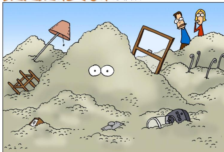
THE EXTRA FOOLISH MAN BUILDS HIS HOUSE ON THE SAND, USING SAND

MARK YOUR CALENDAR NOW FOR THE FH ANNUAL FAMILY RETREAT ON FEBRUARY 4TH AND 5TH! Make sure you plan on being there--no matter what it takes! A time of renewing and creating friendships, a time to play and laugh, a time to grow and fellowship!