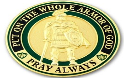
Men's Bible Study starting soon: see Jimmy Gamer for details.