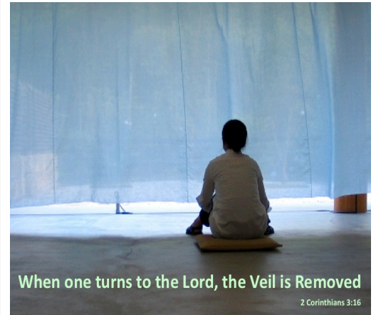
When one turns to the Lord, the Veil is Removed