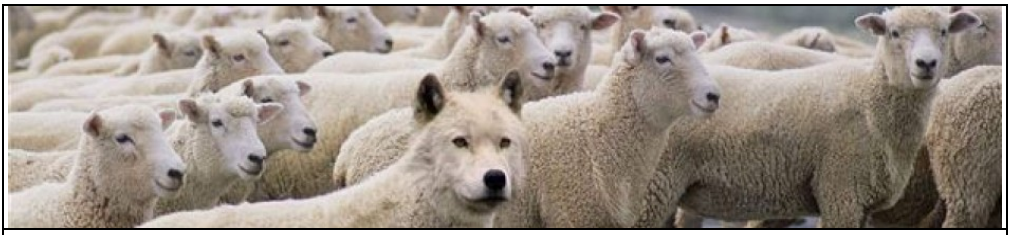
"Stop judging by mere appearances, and make a right judgment." John 7:24 (NIV)

But they shall be priests of God and of Christ, and shall reign with Him a thousand years. Revelation 20:6 Like living stones, let yourselves be built into a spiritual house, to be a holy priesthood , to offer spiritual sacrifices acceptable to God through Jesus Christ. . . . You are a chosen race, a royal priesthood , a holy nation, God's own people, in order that you may proclaim the mighty acts of him who called you out of darkness into his marvellous light. 1 Peter 2:5,9